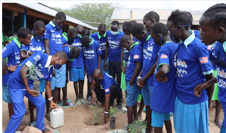
Child Rights Club Members participate in tree planting activity at Hope Primary School

Members of the Child Rights Club at Hope Primary School in Kakuma took up an initiative to plant trees around the school compound.