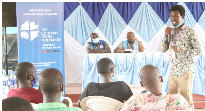
One of the youth in attendance participates in discussions during the Youth Congress held at Turkana West

Youth leaders from several wards in Turkana West Sub-County participated in the 4th annual youth congress convened to strengthen networking between the youth and stakeholders.