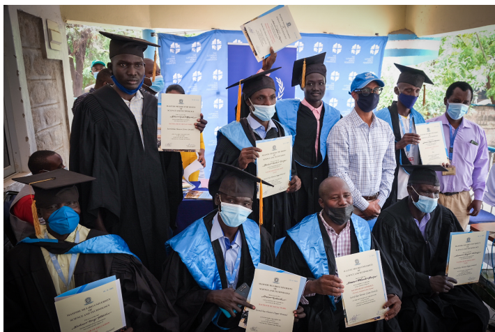
Students who attained various degrees during the graduation ceremony held at LWF Kakuma Office

A graduation ceremony was held for 145 refugee students who successfully completed higher education learning from Masinde Muliro University. The students attained various awards ranging from Certificate, Diploma to Degree programs.