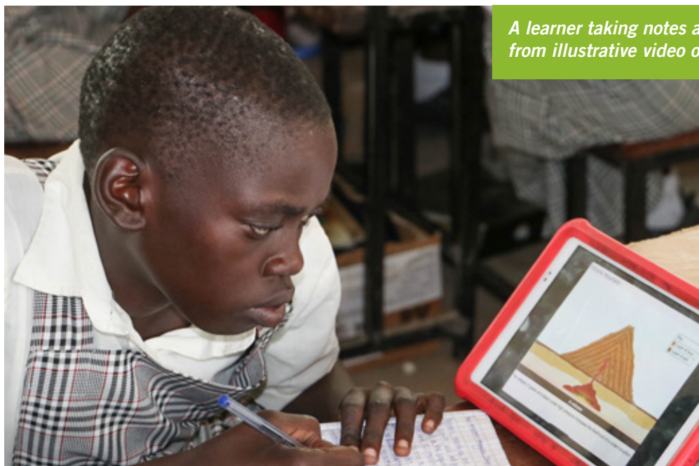
A learner taking notes as she follows instructions from illustrative video on volcanic eruption.

The Kakuma morning sun is already up as young learners of Angelina Jolie girls boarding school settle down for their social studies activities lesson. Today, the grade 6 class, comprising girls between the ages of 13 to 16, will be learning about volcanoes.