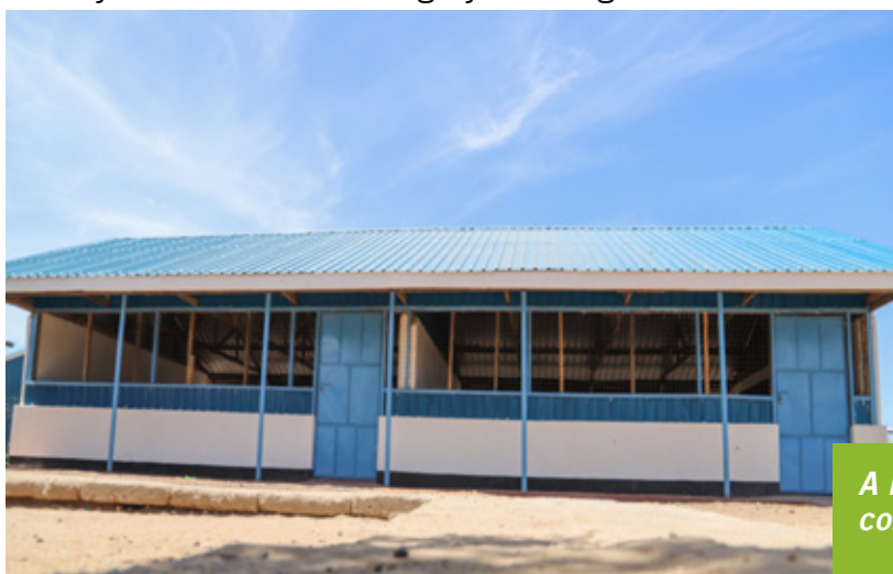
A block of two new classrooms recently constructed at Lokitaung Pre-School