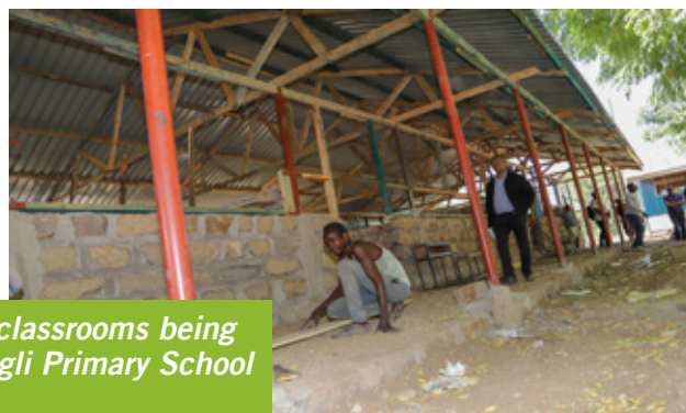
A block of four new classrooms being constructed at Kadugli Primary School courtesy of UNHCR.

LWF works with refugee children, families, and communities to defend these rights by giving children access to information and decision-making opportunities, easing access to resources, and helping adults understand the laws in place to protect children.