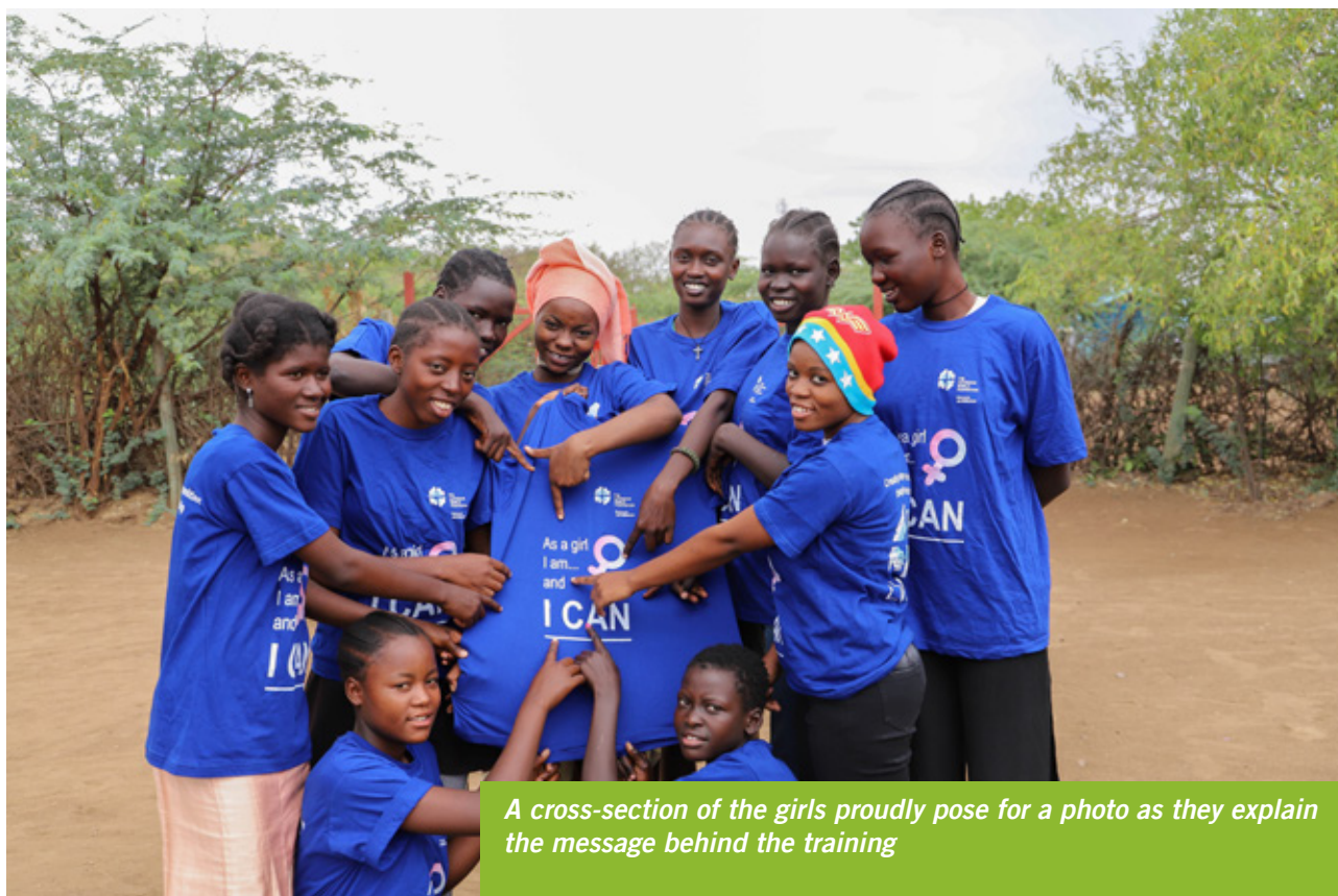
A cross-section of the girls proudly pose for a photo as they explain the message behind the training

They say a journey of a thousand kilometers begins with one step. In the month of June 2022, the Lutheran World Federation (LWF), set out on a very unique journey that brought together 270 girls from Kakuma and Kalobeyei refugee camps. The sole target was to lead them towards empowerment by offering interactive mentorship and life skills training.