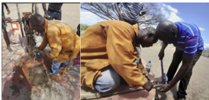
Hand pump repair in progress at Nawotom.

The sight of clean water trickling from the restored pumps delighted the locals who have endured drought. “It is a new dawn for our village. The time we used to spend walking long distances to fetch water for our families can now be utilized for farming” stated a community member.