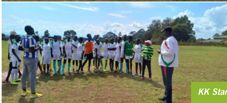
KK Starlets warming up before kick off time.

The temperatures in Kitale were low but our Kakuma Kalobeyei Starlets, better known as 'KK', remained in high spirits as they played friendlies against seasoned teams listed in the Kenya Women's premier league - Tranzoia Falcons and Majesty Queens FC.