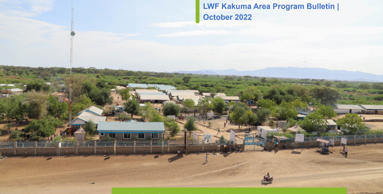
Aerial View of Kakuma Reception Centre.