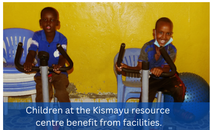
Children at the Kismayu resource centre benefit from facilities.

With support from donors, LWF Somalia Sub Program reaches out to people of concern in Somalia and provides humanitarian assistance within its mission to address the causes and effects of human suffering and poverty.