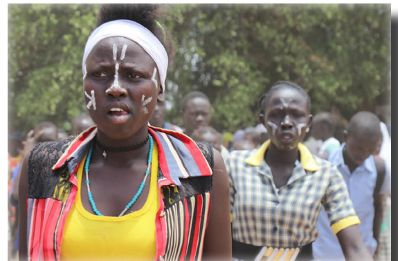
[Cultural dance Presentation during the Peace Day Event]

During this year’s International Day of Peace celebrations held on the 21st of September 2018, LWF with the support of DCA (Dan Church Aid) organized a Peace Concert at Youth Centre 3 in Kakuma - 2 and provided an open forum for the learners to showcase their talents. The event attracted various participants in competition and the best three performing clubs in each category were awarded with gadgets as an incentive to motivate their performance in educational programs. Presentations revolved around peaceful coexistence guided by the theme of the day The Right to Peace marking the milestones of peaceful co-existence between the refugee and the host community.