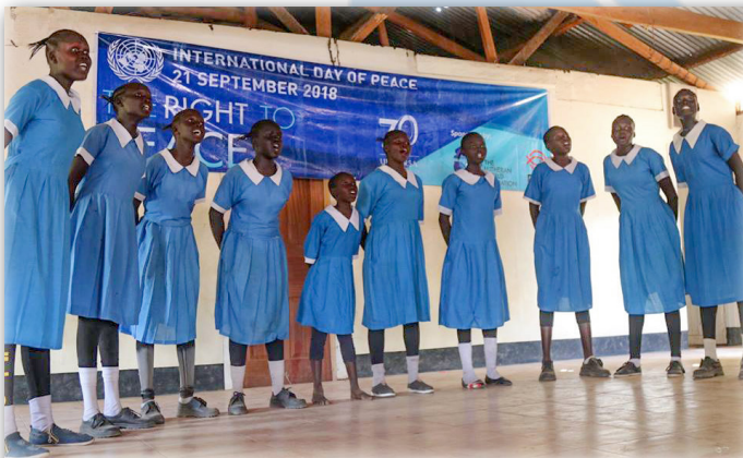
[Poem presentation during the Peace Day event]

Lutheran World Federation – Kenya, the lead implementing agency for UNHCR in basic education in Kakuma and Dadaab refugee camps supports learners to nurture their leadership, negotiation and arbitration skills. Peace education in schools has played an integral role in nurturing children to be peace ambassadors both in schools and in their respective communities. The sessions cover a range of issues on the conflict continuum in line with the UN Peace education manual.