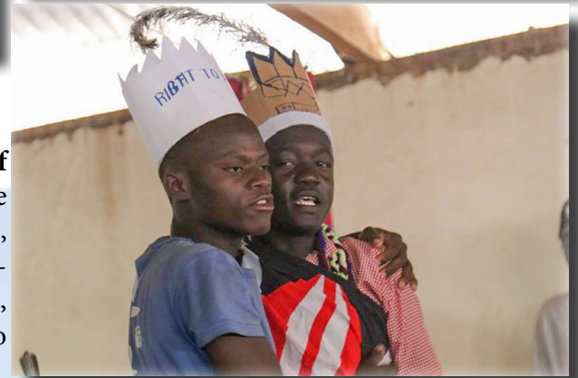
[Skit presentation during the Peace Day Event]

Inclusion and meaningful participation form part of LWF's core values: We are committed to being inclusive and enabling the full and equitable participation of men, women, children, people of all ages and persons with disabilities. We understand power dynamics, cultural norms, access to resources and other factors creating barriers to participation and we work to overcome these.