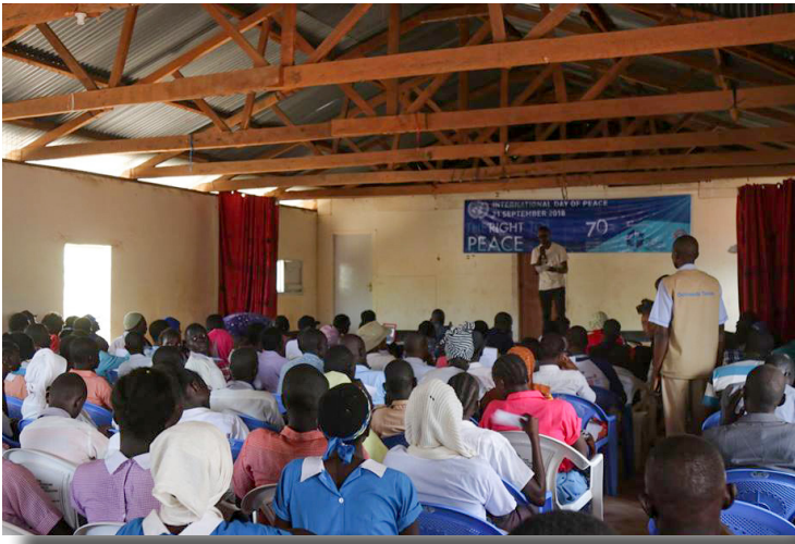
[Discussions during the Peace Day event]